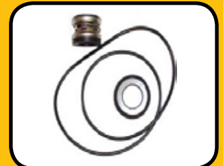
HYPRO PUMP REPAIR KIT