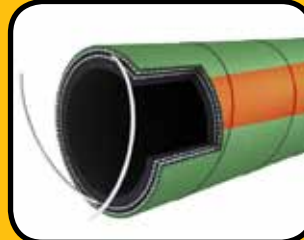
2" WB HOSE