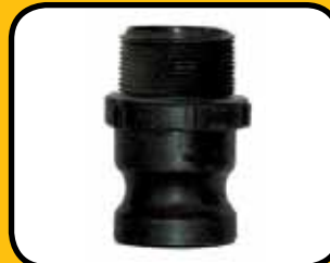
2" QUICK COUPLER